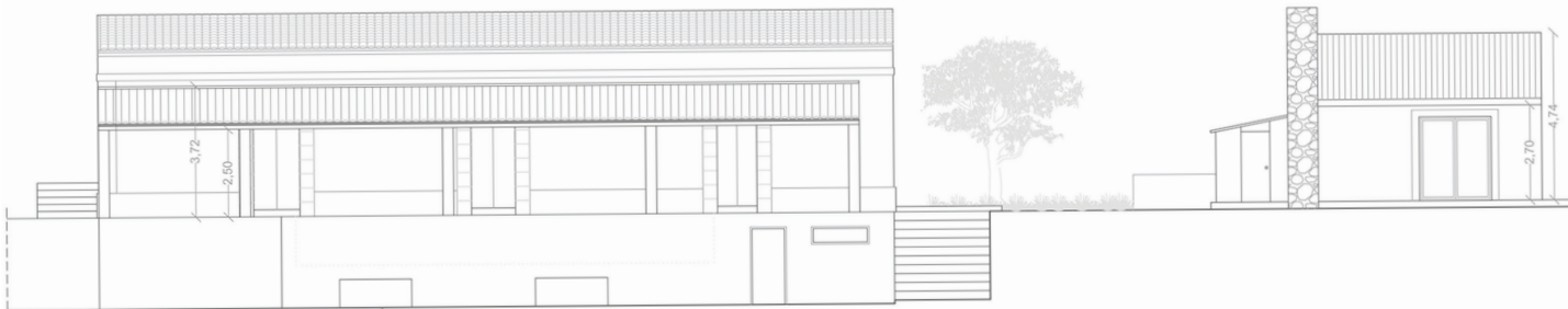
Prospetto Nord - Ovest